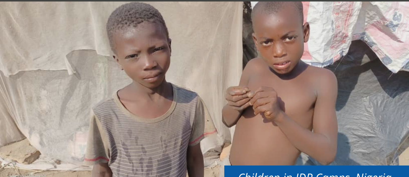
Children in IDP Camps, Nigeria